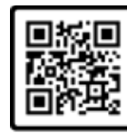
Donate to Auxiliary

New in 2023, the ACOFP Foundation established a fund to support scholarships to students via the Auxiliary Fund. Donations to this fund are tax-deductible and support the following initiatives: