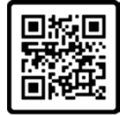
Watch the Foundation Milestone video